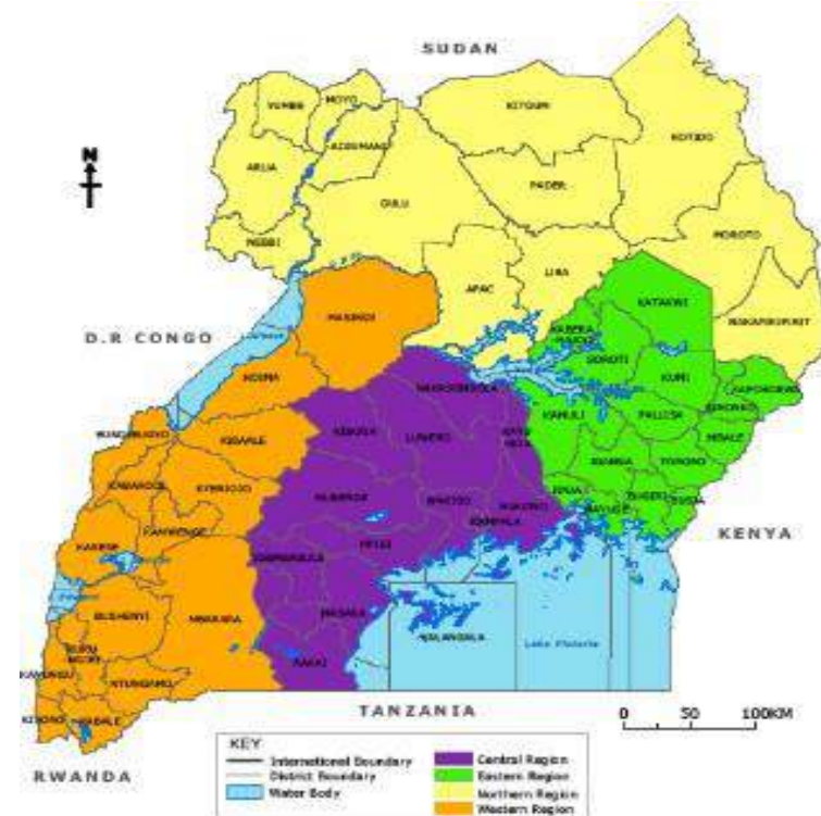
FIGURE 1a Map of Uganda showing the Central, Eastern, Northern and Western regions.

The Republic of Uganda is a landlocked country in East Africa, and has seen an increase in life expectancy from 39 years in 1950 to 64 years in 2021[13], and is thus beginning to experience an increase in the diseases of an aging population. Statistically, Uganda is divided into four regions: Central, Northern, Eastern and Western and administratively into 146 districts, with 70,626 villages. The Uganda population is estimated at 47 million, with a population density of 593 people per mi 2 , and 25.7% of the population being urban[14]. Figure 1a shows the statistical, not administrative, regions of Uganda; Figure 1b shows the current administrative districts of Uganda. In general, Lugbara (Lugbarati) and Luo are spoken in the Northern Region; Ateso in the Eastern Region; Runyankole-Rukiga and Runyoro - Rutoro in the Western Region and Luganda in the Central Region and part of the Eastern Region.